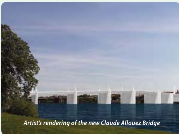
Artist's rendering of the new Claude Allouez Bridge

Located at the east approach to the new Claude Allouez Bridge, the roundabout will provide a beautiful gateway to downtown.